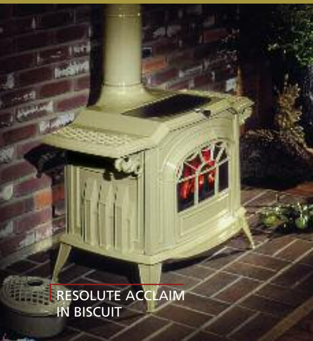
RESOLUTE ACCLAIM IN BISCUIT

With its compact size and optional short legs, the Intrepid II from Vermont Castings will fit just about anywhere! This compact catalytic wood stove offers high efficiency – more heat from less wood – as well as a clean burn, making it great for the environment as well. With a standard automatic thermostat and front or top loading convenience, the Intrepid II also offers optional warming shelves with mitten racks, a clearance reducing rear heat shield and your choice of classic Vermont Castings enamel colors. This beautiful little wood stove may be small in size, but it's certainly not short on style.